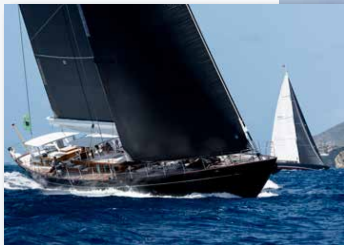
Art Direction & Design by Jim Herrmann / graphiclanguageonline.com

See SI Exhibit 2 and Page 6 for the racing and shoreside schedule details.